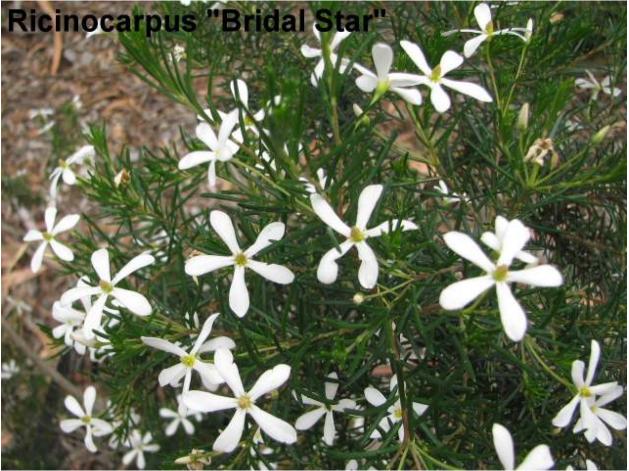
Ricinocarpus "Bridal Star"