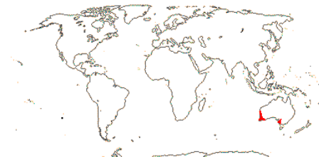
World distribution: Only in Australia

According to Wikipedia, this is a family of flowering plants - although not commonly recognized by taxonomists because the plants involved were usually included in the family Xanthorrhoeaceae .